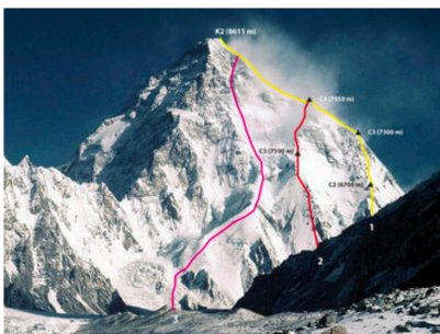
1-Abruzzi 2-Cessen 3- Kukuczka-Piotrowski